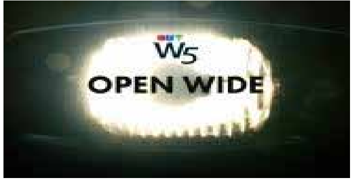
2022 21:51 min CTV

#CTV889 $139: DVD 3 yr Streaming Rights: $209