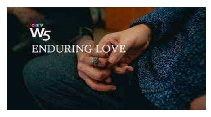
2022 21:26 min CTV

#CTV895 $139: DVD 3 yr Streaming Rights: $209