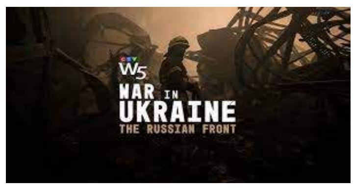
2022 31:33 min CTV

This W5 special takes you to the frontlines of the Russian invasion of Ukraine. As the world holds its breath for what might happen next, a humanitarian crisis is unfolding and regular Canadians are preparing to join the battlefield. #CTV890 $139: DVD 3 yr Streaming Rights: $209