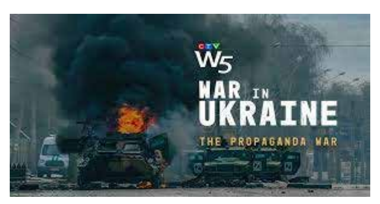
2022 23:16 min CTV

#CTV905 $139: DVD 3 yr Streaming Rights: $209