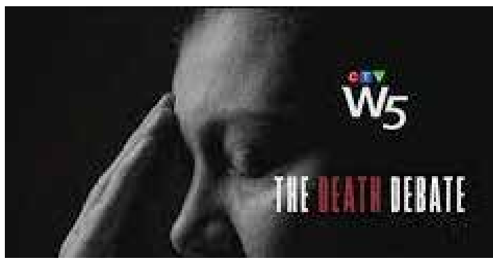
2022 21:28 min CTV Some experts warn Canada is about to become the most liberal country in the world in allowing medical assistance in dying (MAiD) for people with mental disorders. #CTV908 $139: DVD 3 yr Streaming Rights: $209