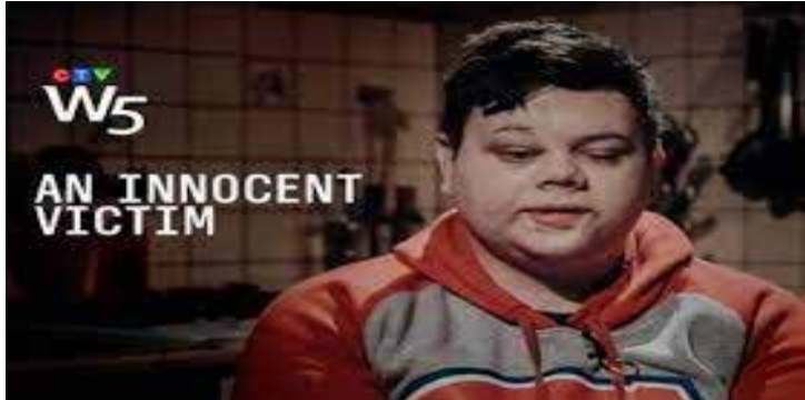
2022 21:43 min CTV

#CTV918 $139: DVD 3 yr Streaming Rights: $209