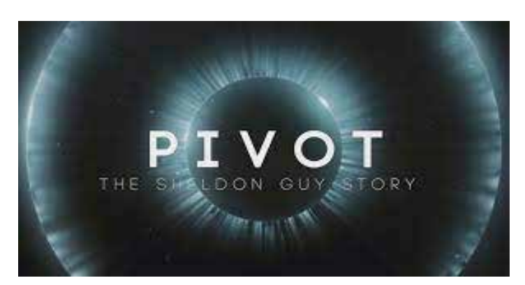
2022 22:15 min CTV

#CTV915 $195: DVD 3 yr Streaming Rights: $295