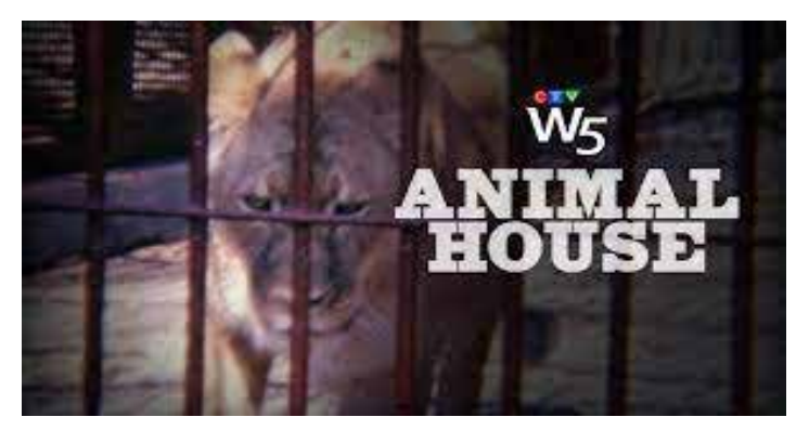
2022 21:17 min CTV In the summer of 2022, advocacy group Animal Justice secretly documented conditions at so-called "roadside zoos" across Ontario. CTV W5 investigates into what happens at facilities with little oversight and regulation. #CTV913 $139: DVD 3 yr Streaming Rights: $209