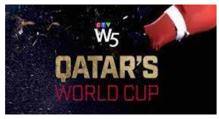
2022 45 min CTV

#CTV912 $139: DVD 3 yr Streaming Rights: $209