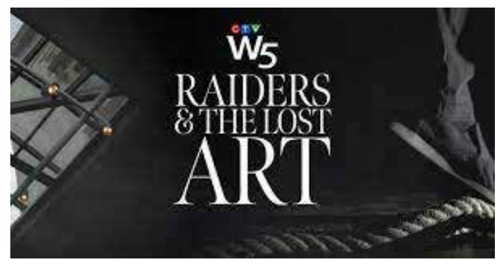
2022 20 min CTV

CTV W5 investigates Canada's largest art heist. Fifty years ago, thieves snatched masterpieces from the walls of Montreal's Museum of Fine Arts. The crime has never been solved. What happened to the masterpieces? Art Recovery International founder Christopher Marinello discusses. #CTV917 $139: DVD 3 yr Streaming Rights: $209