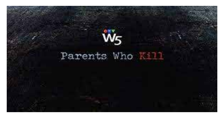
2022 21:43 min CTV