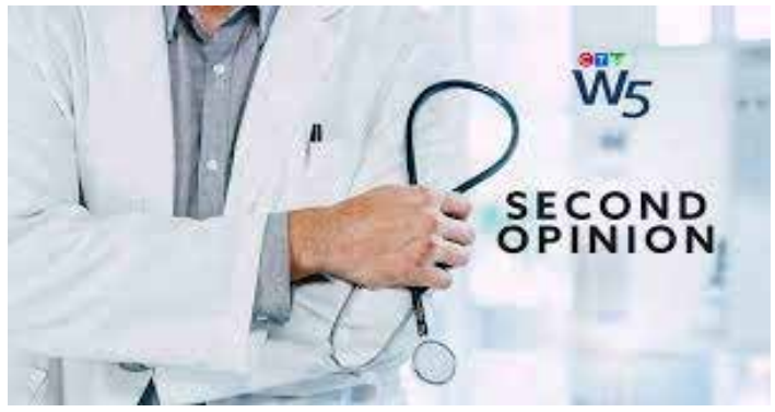
2022 22:24 min CTV

#CTV900 $139: DVD 3 yr Streaming Rights: $209