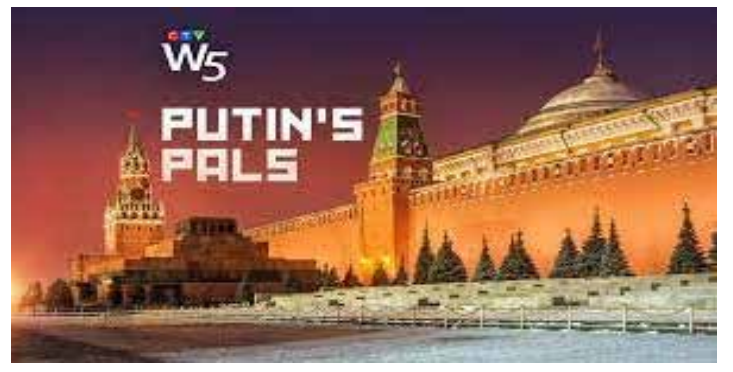
2022 21:28 min CTV

#CTV899 $139: DVD 3 yr Streaming Rights: $209