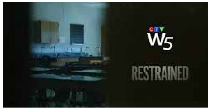
2022 22:09 min CTV

#CTV914 $139: DVD 3 yr Streaming Rights: $209