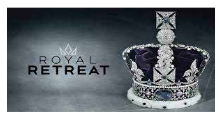
2022 20 min CTV

#CTV902 $139: DVD 3 yr Streaming Rights: $209