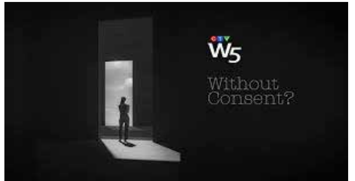
2022 20 min CTV

W5 investigates Canadian doctors performing the irreversible procedure of irreversible forced sterilizations on Indigenous women. These horrifying allegations are discussed.