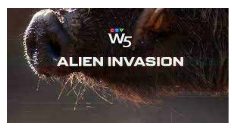
2022 22:09 min CTV Authorities have spent $1.5 trillion over 50 years to prevent the spread of invasive species throughout the world. But is humanity fighting a losing battle in a war that it started? #CTV907 $139: DVD 3 yr Streaming Rights: $209