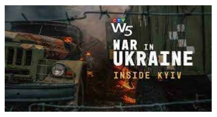
2022 45:25 min CTV

This W5 special takes you to the frontlines of the Russian invasion of Ukraine. As the world holds its breath for what might happen next, a humanitarian crisis is unfolding and regular Canadians are preparing to join the battlefield. #CTV890 $139: DVD 3 yr Streaming Rights: $209