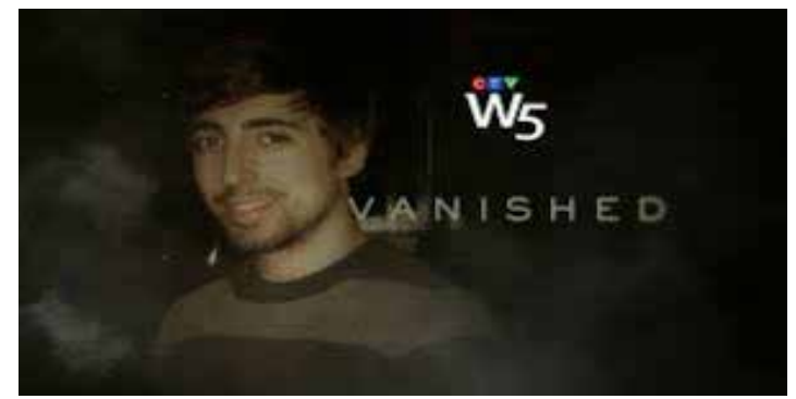
2022 20 min CTV

#CTV904 $139: DVD 3 yr Streaming Rights: $209