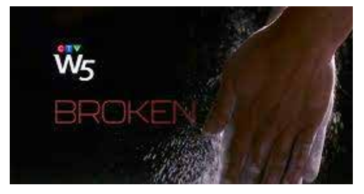
2022 89:36 min CTV

CTV W5 investigates Canada's largest art heist. Fifty years ago, thieves snatched masterpieces from the walls of Montreal's Museum of Fine Arts. The crime has never been solved. What happened to the masterpieces? Art Recovery International founder Christopher Marinello discusses. #CTV917 $139: DVD 3 yr Streaming Rights: $209