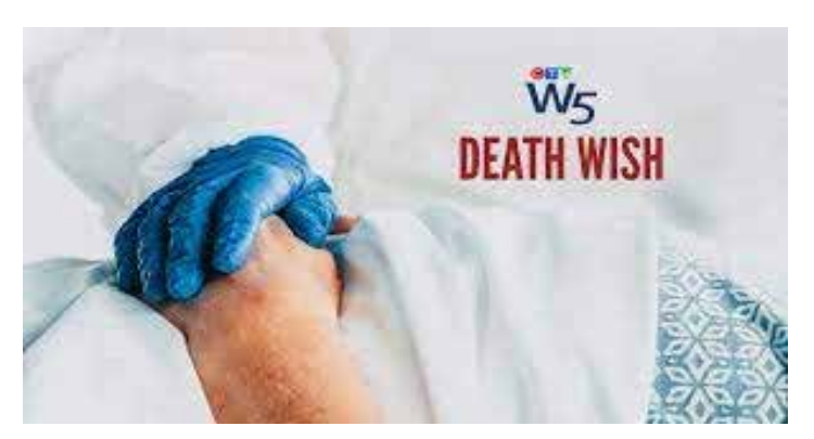
2022 20 min CTV CTV W5 investigates the growing demand for medically-assisted death, and reveals stories of those determined to die with dignity. #CTV919 $139: DVD 3 yr Streaming Rights: $209