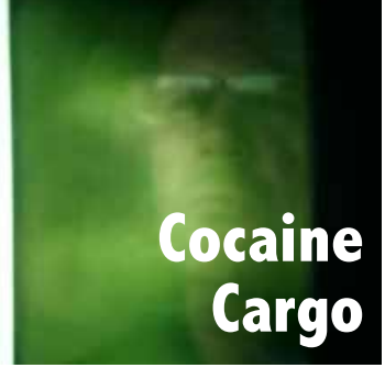
2022 20 min CTV

A Canadian airline crew accused of smuggling drugs speaks exclusively to W5, revealing never-before-seen video that could prove their innocence.