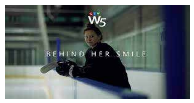
2022 23 min CTV

#CTV906 $139: DVD 3 yr Streaming Rights: $209